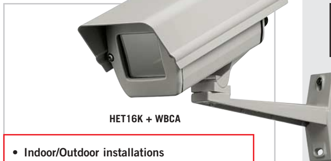
HET16K + WBCA

A wide range of accessories is available, including sunshield heater kit and camera power supply in weatherproof box.